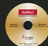
HotView™ mesh management software