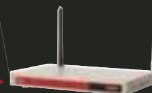
Indoor mesh nodes