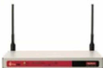
HotPort 3103 Front