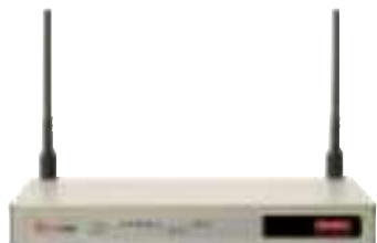
HotPort 3101 Front