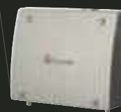
Outdoor mesh nodes