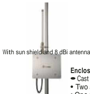
With sun shield and 8 dBi antenna