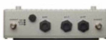
Bottom panel and connectors